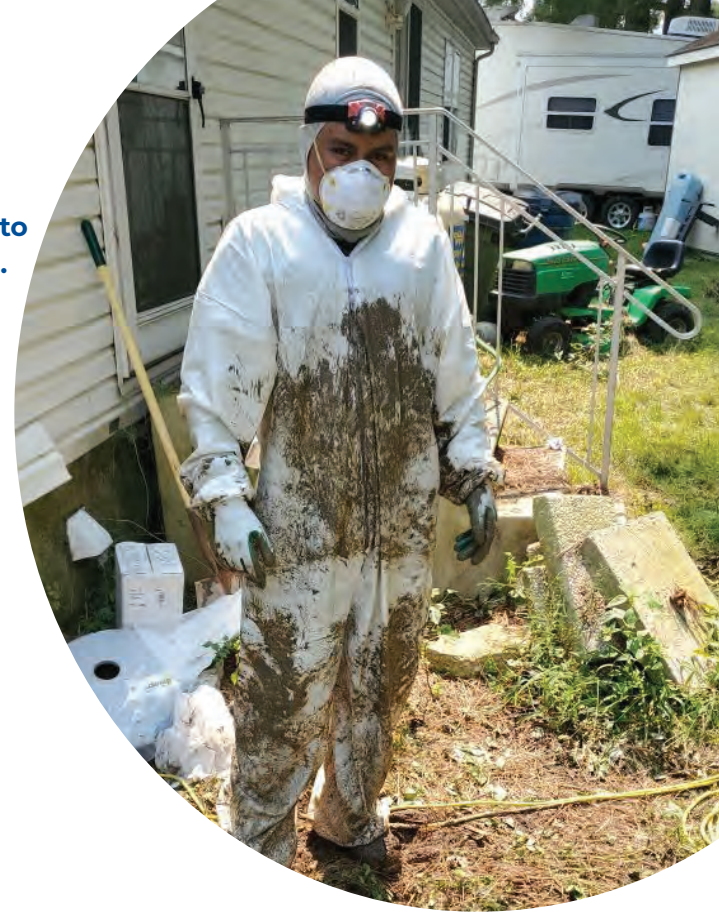
Contractor replacing a sump pump is a dirty job

Program participation was reduced in 2021 due to the COVID-19 virus, and we had a shortage of contractors to do the work. However, program staffing has improved, and more contractors have been hired to perform the work. Without this vital Energize Delaware program, these families would not receive the essential benefits of the Weatherization Program.