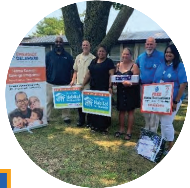
Homeowner and Energy Team