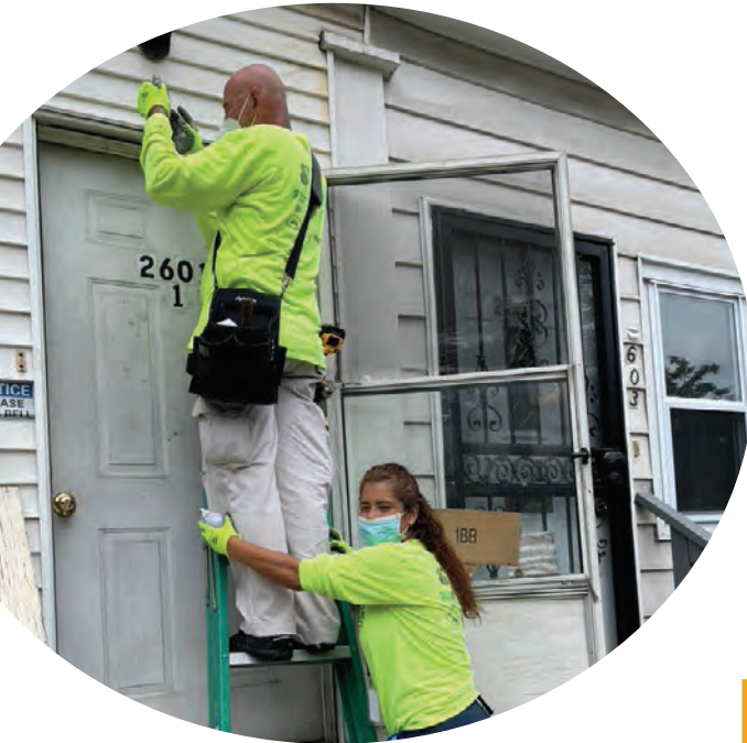
Lights On Delaware Strong changing bulbs

The Energize Delaware Lights On Program has served vulnerable communities in Georgetown, Seaford, Milford, Laurel, and Wilmington since 2017. The program’s goal is to increase neighborhood safety in participating communities by improving exterior lighting. Since 2017, more than 6,600 homes have received energy-efficient LED porch lights through this program.