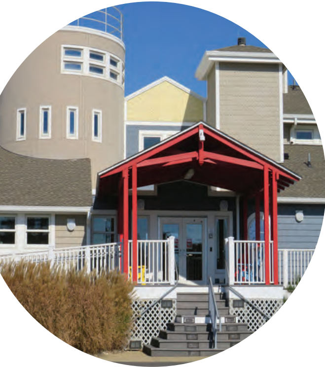
Children's Beach House, Lewes

These unique commercial loans are structured to be cash positive from day one. In most cases, energy savings over the life of the project are more than the investment, including financing. The program's objective is to encourage energy efficiency, customer-sited renewable generation, or greenhouse gas reduction measures. The result is lower customer utility bills and reduced environmental impact.