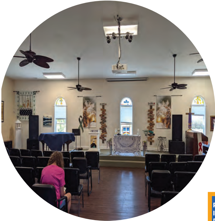
Metropolitan Community Church – Rehoboth

The Faith Efficiencies Program provides a wide range of energy resources, including energy audits, remediation strategies, funding options and ongoing cost-saving energy education to faith communities throughout Delaware.