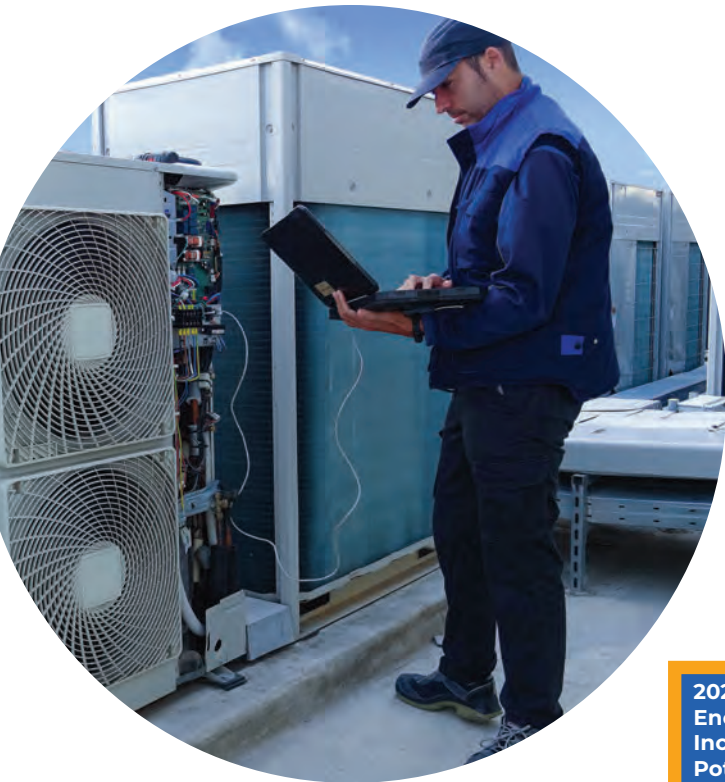
Contractor Site Visit

The Energize Delaware Affordable Multifamily Housing Program helps building owners identify, plan, and implement energy efficiency and renewable energy upgrades in existing buildings and new construction projects..