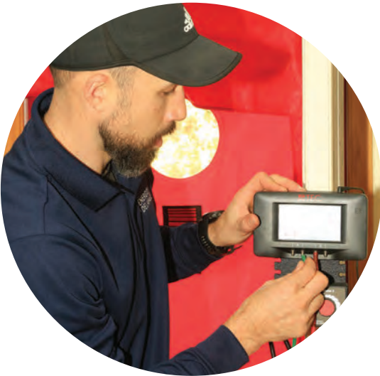
Contractor conducting a HPwES home audit

The flagship Home Performance with ENERGY STAR® program is going into its ninth year. Franklin Energy, continuing as our program partner, now employs 6 staff members in Dover. A whole-house approach to improving comfort and safety in the home, provides homeowners significant savings on their utility costs. Delaware homeowners learn ways to improve the energy efficiency of their homes through the completion of a subsidized, comprehensive home energy assessment performed by certified contractors. They also receive up to $200 of energy saving items such as LED light bulbs and pipe insulation.