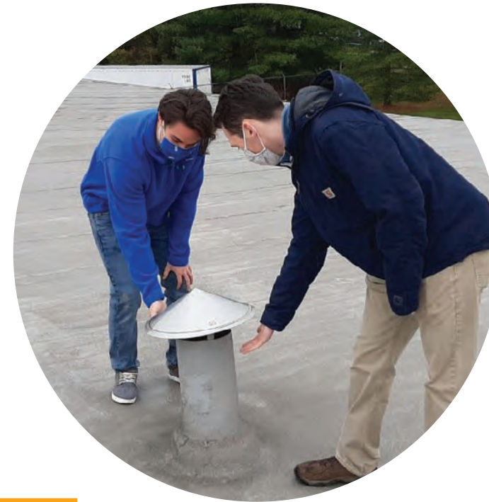
University of Delaware Students checking roof vent

This year, Energize Delaware conducted a robust program impact evaluation and identified five main improvement areas, including strengthening the financing support, adjusting the timing of the follow-up implementation survey and streamlining the energy audit report findings into an executive summary.