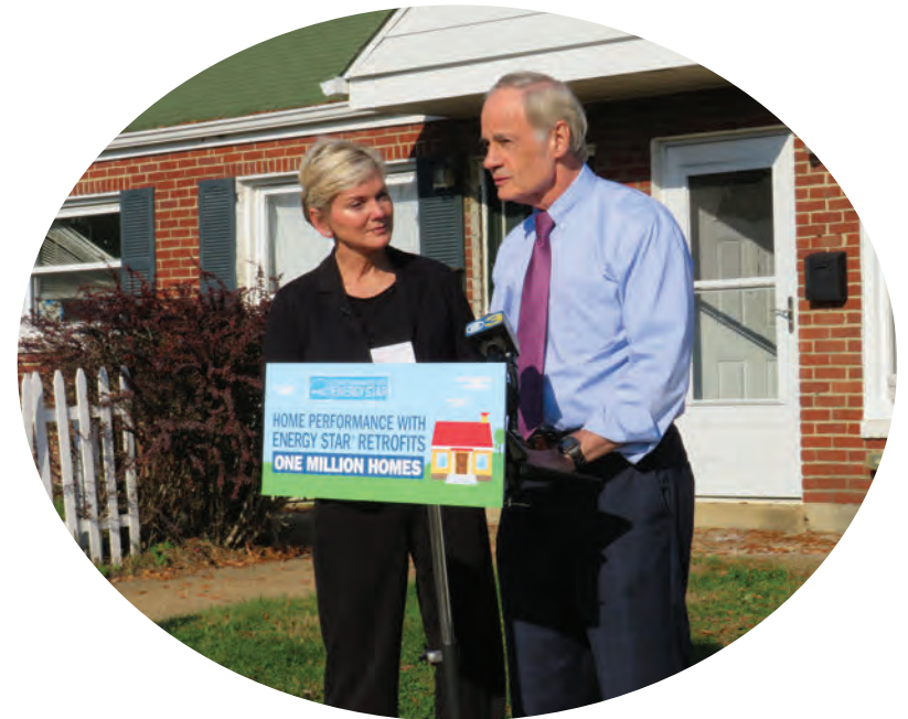
U.S. Secretary of Energy, Jennifer M. Granholm and U.S. Senator Tom Carper

Energize Delaware Virtual Assessments Launched — Motivated by so many people staying home during the pandemic and so many energy auditors unable to visit homes, this program was launched so Delawareans can participate online in a program that will walk them through a “do it yourself” energy assessment.