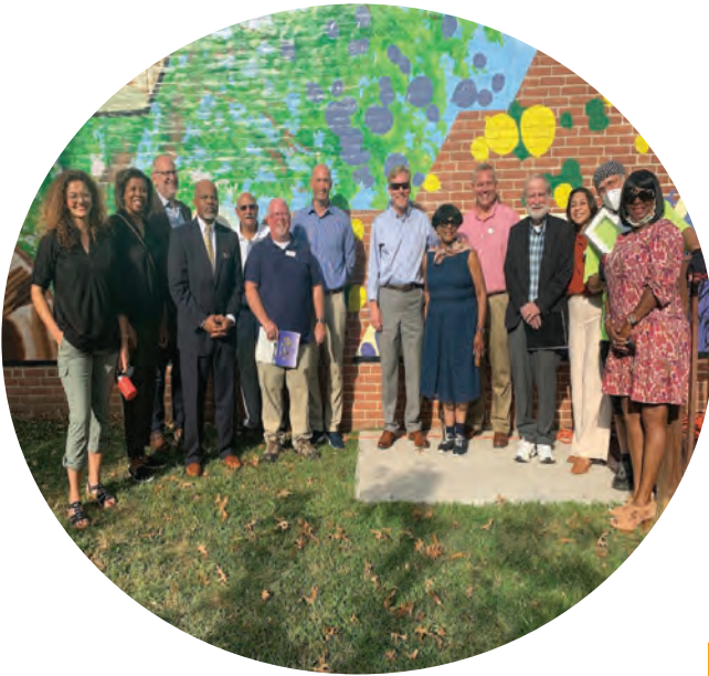
Launch of a Empowerment Program

The Empowerment Grant Program (EGP) that Energize Delaware proudly developed and administered has now awarded $4 million in energy efficiency grants for underserved communities in all three counties. These grant funds of the Empowerment Grant were made possible by the merger between Exelon Power and Delmarva Power in Delaware and authorized by the Delaware Public Service Commission.